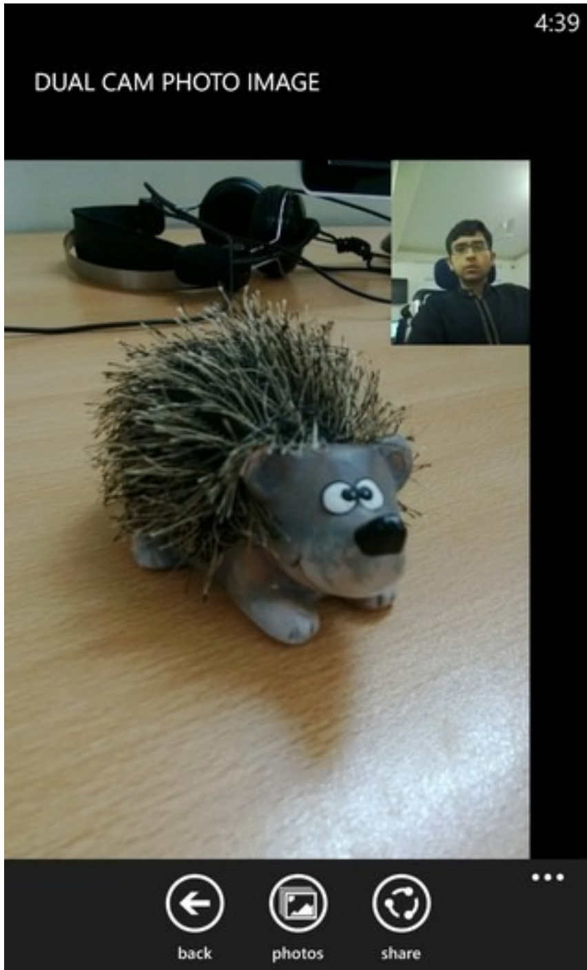
Figure 1. Dual Camera Photo Capture On Windows Phone 8