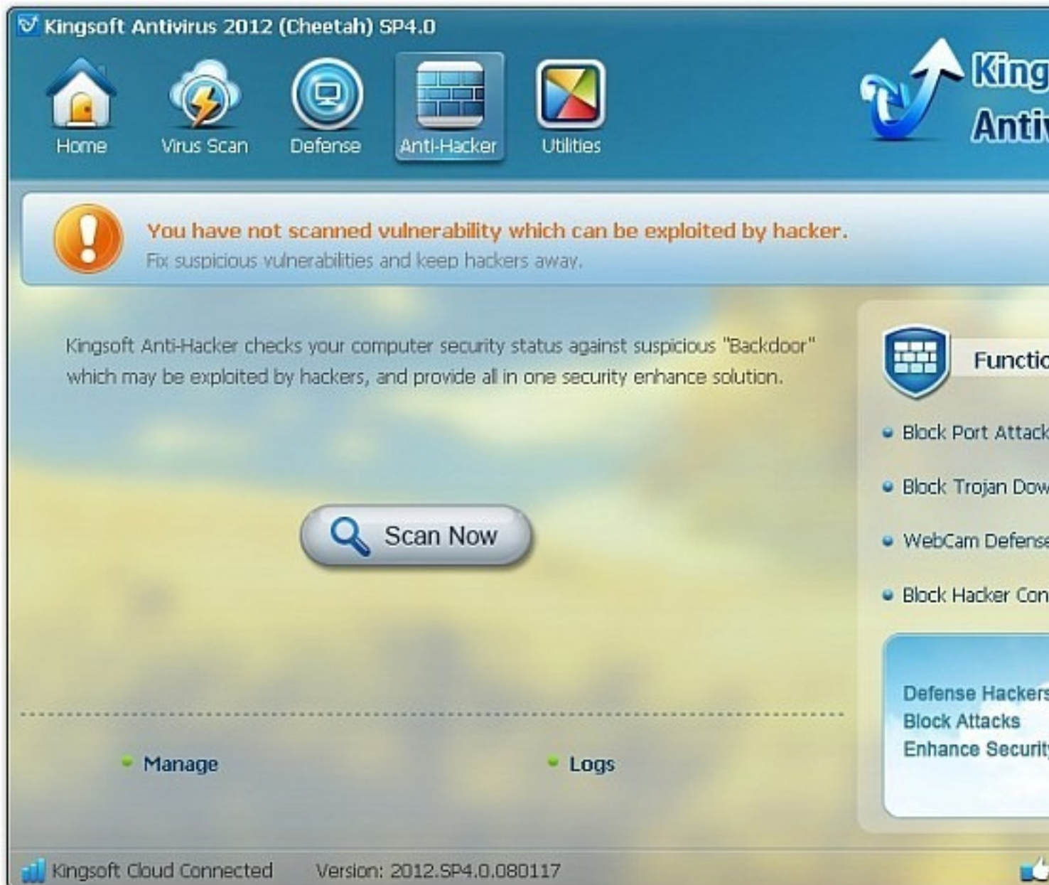
The screenshot is taken on a Windows PC via a click of the main window button on the desktop right-click menu, and the screenshot is taken on a Windows PC via a click of the main window button on the desktop right-click menu.